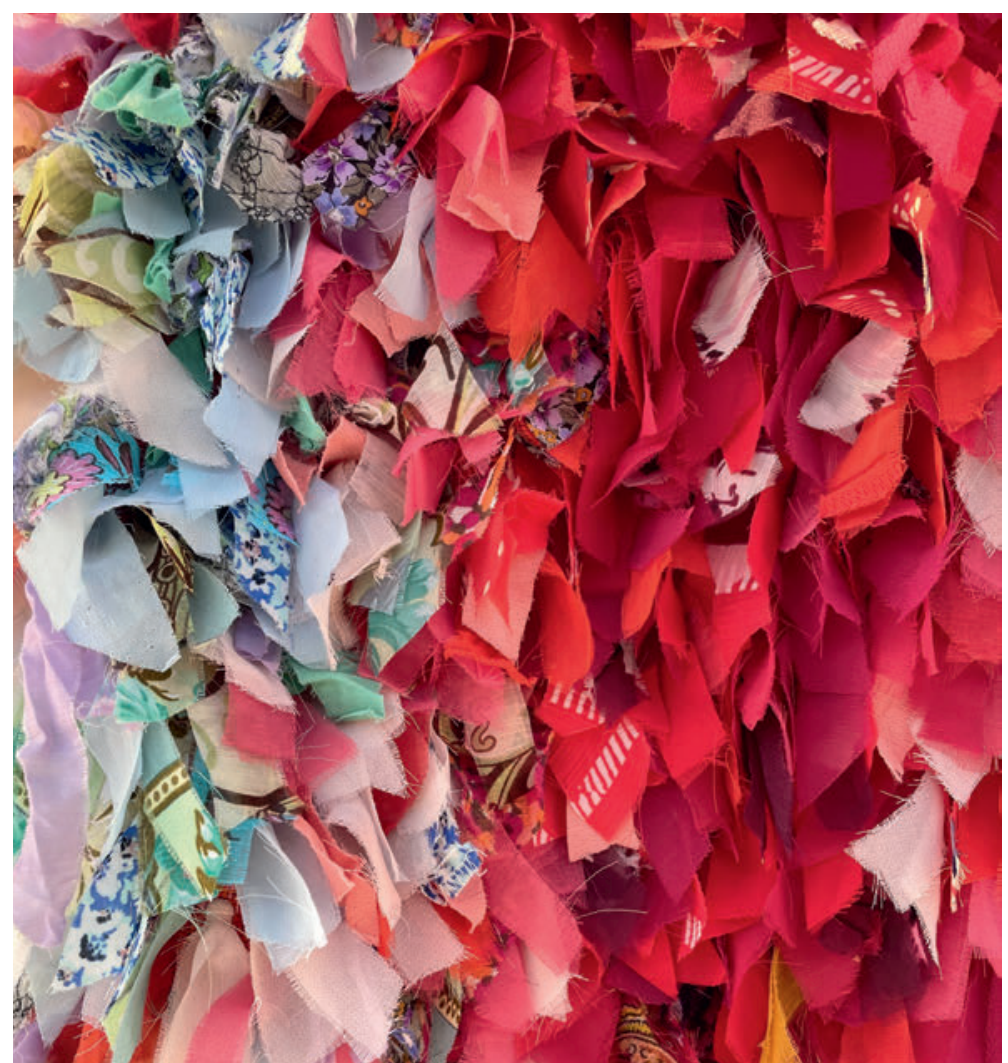
A MÄÄTTÄ SILTBER

The weaving technique used is Moorman, developed by Theo Moorman (1907 –1990). The pattern picks are woven on top of a foundation of plainweave. Vega offers the mental image of moss growing on a rock. The technique offers free composition where the weft floats create shapes and structures.